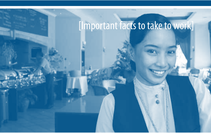
[Important facts to take to work]

You can find more information on WorkSafeNB's programs and services at www.worksafenb.ca .