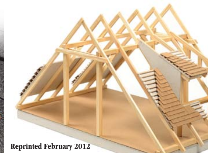
Reprinted February 2012