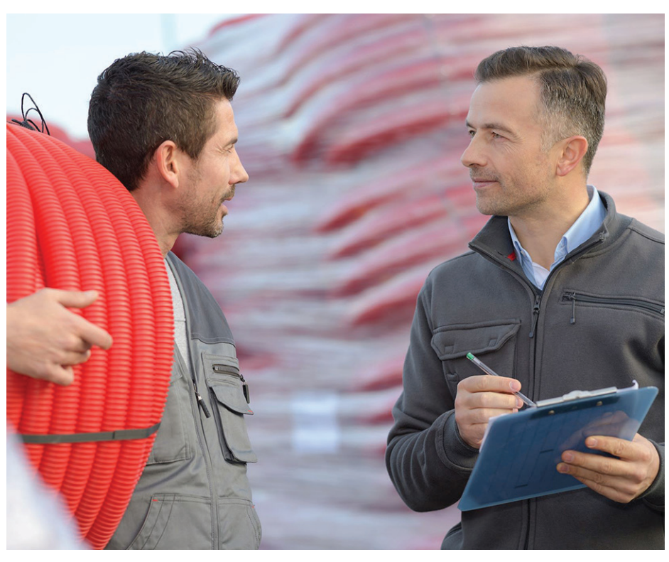
In 2020, we mature from an organizational structure focused on geography to a structure focused on functional alignment.

↑ TorkSafeNB's ongoing transformation requires not only the evolution of our business processes and technology systems, but also the ongoing transformation of our workforce. As our work evolves, so too must the knowledge and skills of our employees. As such, in 2020, we mature from an organizational structure focused on geography to a structure focused on functional alignment. This change will allow for greater end-to-end process oversight, greater efficiencies and better client service, and will also help us prepare for the new claims management system as we undergo business transformation.